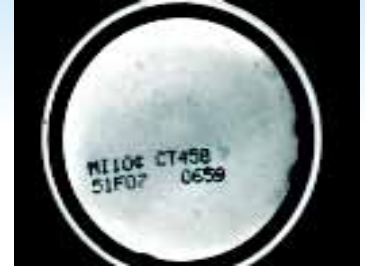
Acquired Solution Image

The concave, reflective surface of an aluminum can bottom creates a challenge for an OCR inspection. The DL2230 is well suited for this application, with an opening diameter slightly larger than the diameter of the can, and sufficient diffuse light to evenly illuminate the inkjet printed code without causing glare.