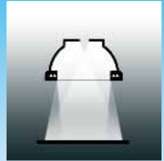
Light Function Diagram