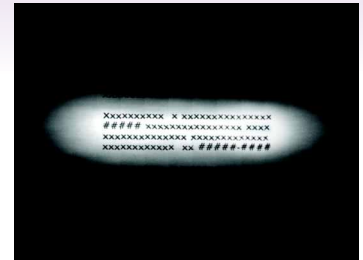
Acquired Solution Image

Although line lights are generally used with line scan cameras, they can also be used with standard vision systems. In this inspection, the object was to check print quality and detect missing labels. Increasing the working distance from the sample in order to generate a wider line, our LL2912E provides a window of light the right size to inspect address labels.