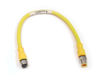
Cable included with light