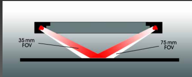
Light Function Diagram