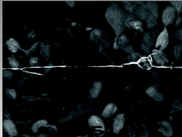
Acquired Solution Image